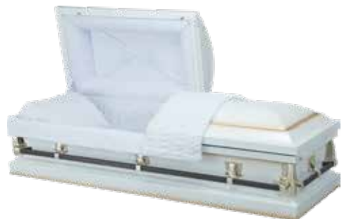
American-Style Caskets* American-style Caskets are available in wood or metal in a wide selection of designs From £1,470