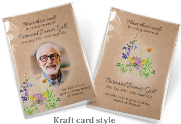
Kraft card style with or without a photo