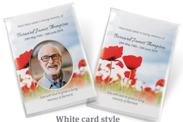
White card style with or without a photo