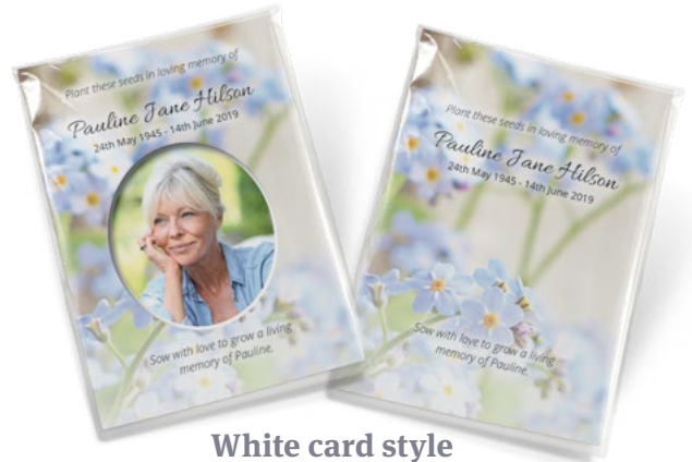
White card style with or without a photo