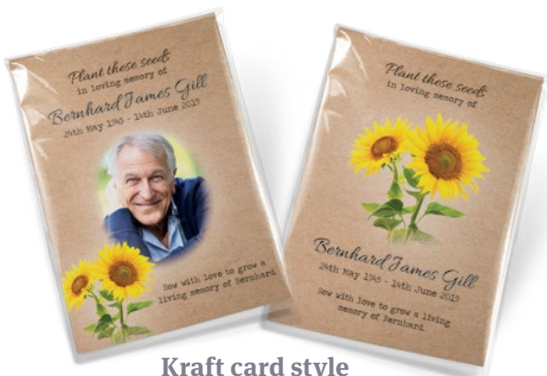
Kraft card style with or without a photo