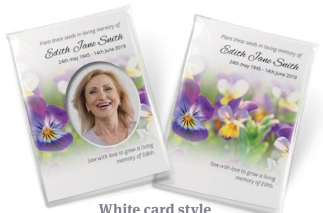
White card style with or without a photo