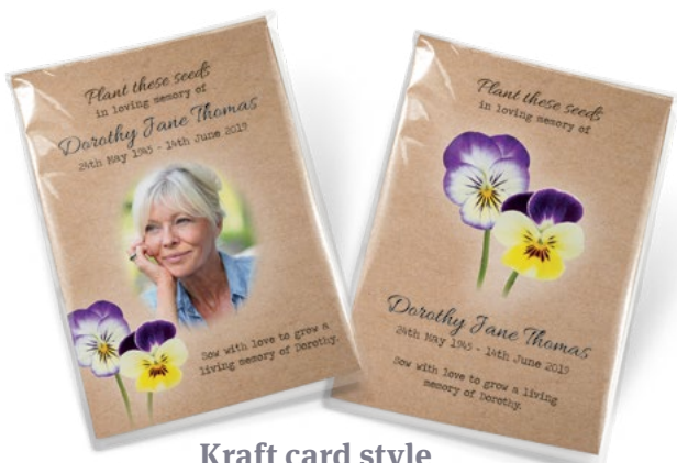
Kraft card style with or without a photo