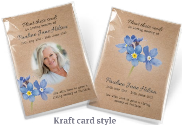
Kraft card style with or without a photo