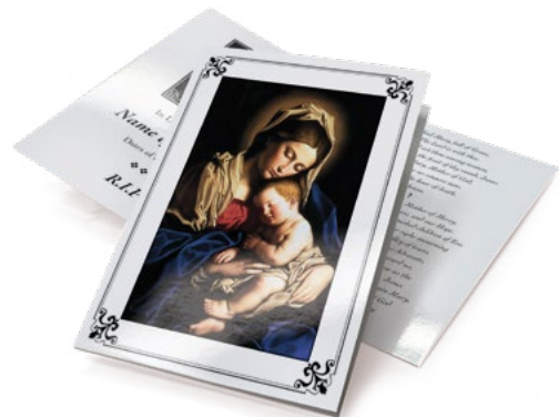
Madonna and Child