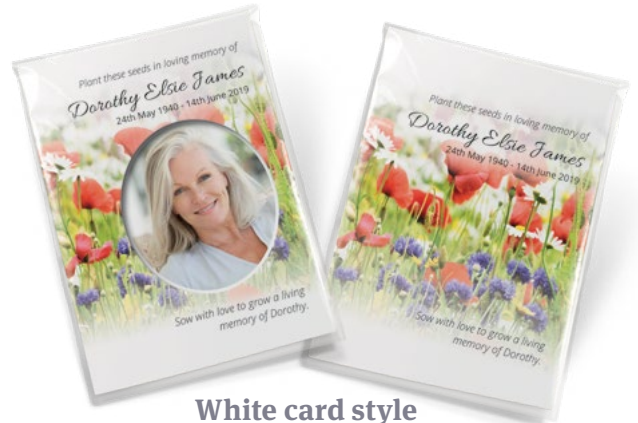
White card style with or without a photo