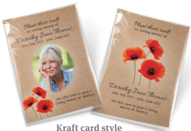
Kraft card style with or without a photo