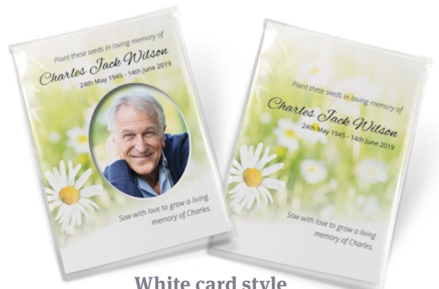
White card style with or without a photo