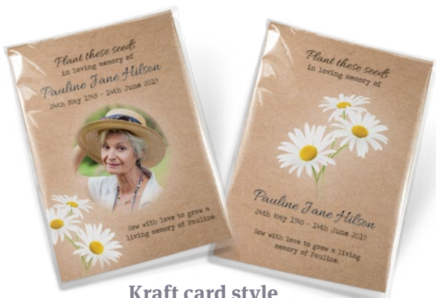
Kraft card style with or without a photo