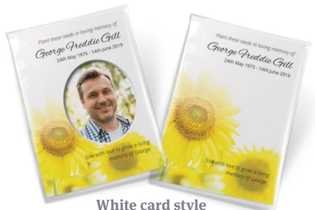
White card style with or without a photo